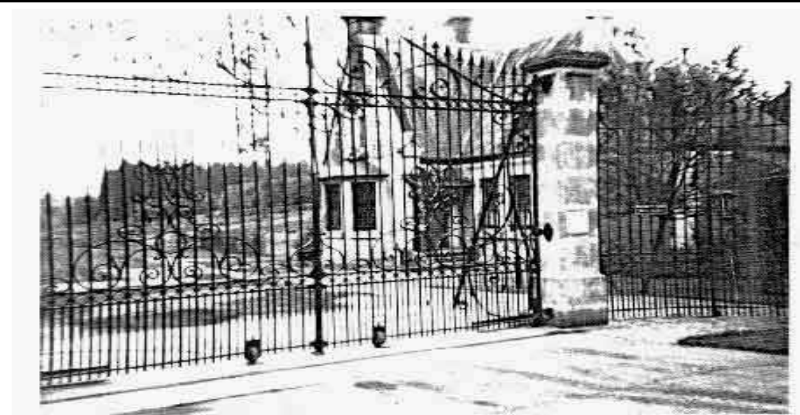
Entrance to the well-guarded Mother-of-Darkness castle in Belgium, where a special large book records daily in blood the activities of the Illuminati to bring in the reign of the AntiChrist.

It was also discovered that the Jesuits-Illuminati are performing satanic rituals inside the Castle Of Darkness in Muno, Belgium. Below is a picture of the entrance or gate going into the well-guarded Castle Of Darkness in Belgium.